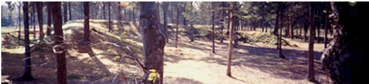
NPS Sustainable Earthworks Management Guidance, Stones River Example Stones River National Battlefield, Murfreesboro, TN

Mid-Long Term: The BHFR and 501(c)3 Battle of Rhode Island Association (BoRIA) have contracted a Landscape Architect Master Plan which is being finalized that will formally present the long term proposed concepts on the entire complex, to include a full vegetation, archeology and arborist vegetation selection and management plans going forward, in keeping with National Park Service (See example), Rhode Island Historical Preservation and Heritage Commission on long term alternatives and best practices on historic preservation.